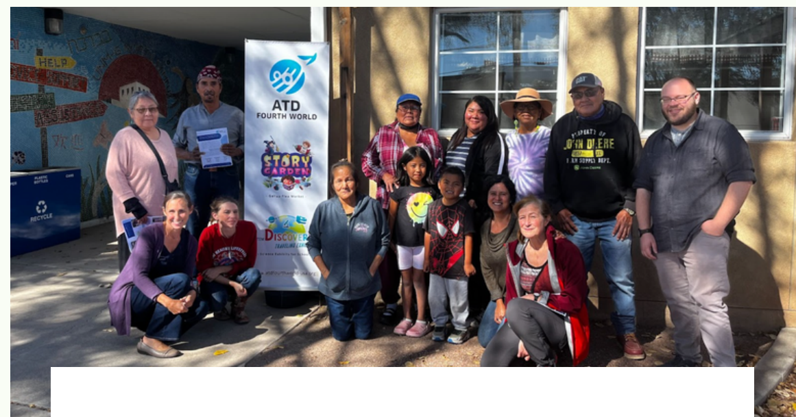
ATD Community Lunches in New Mexico diminish people's isolation, allow friends of ATD Fourth World to meet one another, and create the conditions to empower people and develop a sense of belonging.

"Decent Work and Social Protection: Putting Dignity in Practice for All" was the theme for this year's International Day for the Eradication of Poverty . We witnessed the strength of people with lived experience of poverty navigating their life. People from all walks of life gathered at the United Nations in NYC to advocate for decent work and social protection, committing themselves to putting dignity into practice for everyone.