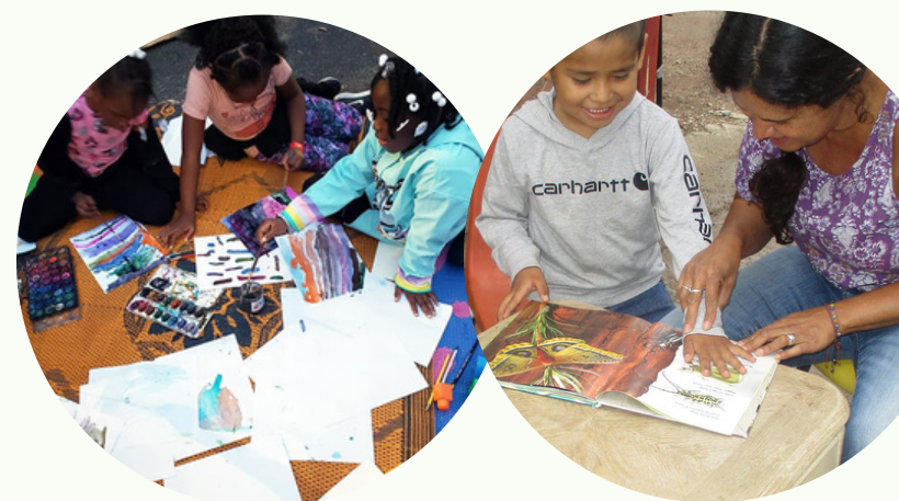
Story Gardens continue to grow learning and community in Brownsville, New York; in Gamarco and at the Gallup Flea Market in New Mexico; and in rural areas of New Mexico and Arizona through the Story Garden on Wheels.