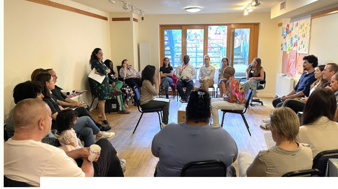
"Dignified Work for All" was studied by people with varied expertise on and experience with poverty at the the Fourth World People's University in NYC and at the United Nation's High Level Political Forum and Commission for Social Development.