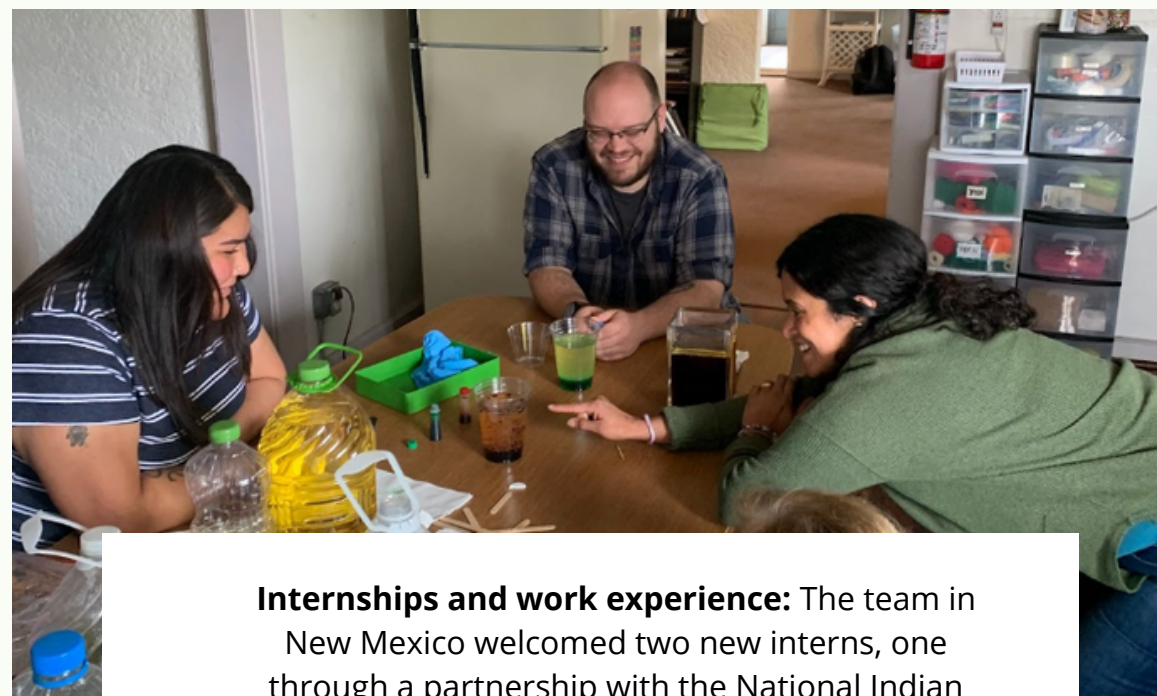
Internships and work experience: The team in New Mexico welcomed two new interns, one through a partnership with the National Indian Youth Council (NIYC) who then joined the team and one through our local network.