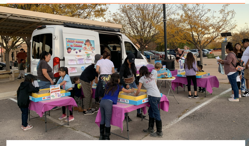
The Learning with Dakota! Project shared its engaging dinosaur educational exhibit and Story Garden on Wheels widened its reach to new families at Gallup's Day of Play.