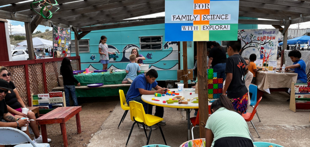
Family Science Day: Explora Science Center and Children's Museum made its annual trip from Albuquerque to the Gallup Flea Market's Story Garden for a day of Family Science. Explora brought along Electric circuits, Seed bombs, Kinetic Sculptures, and Bubbles.